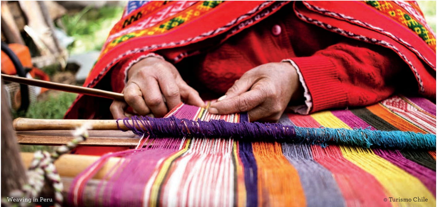
Weaving in Peru