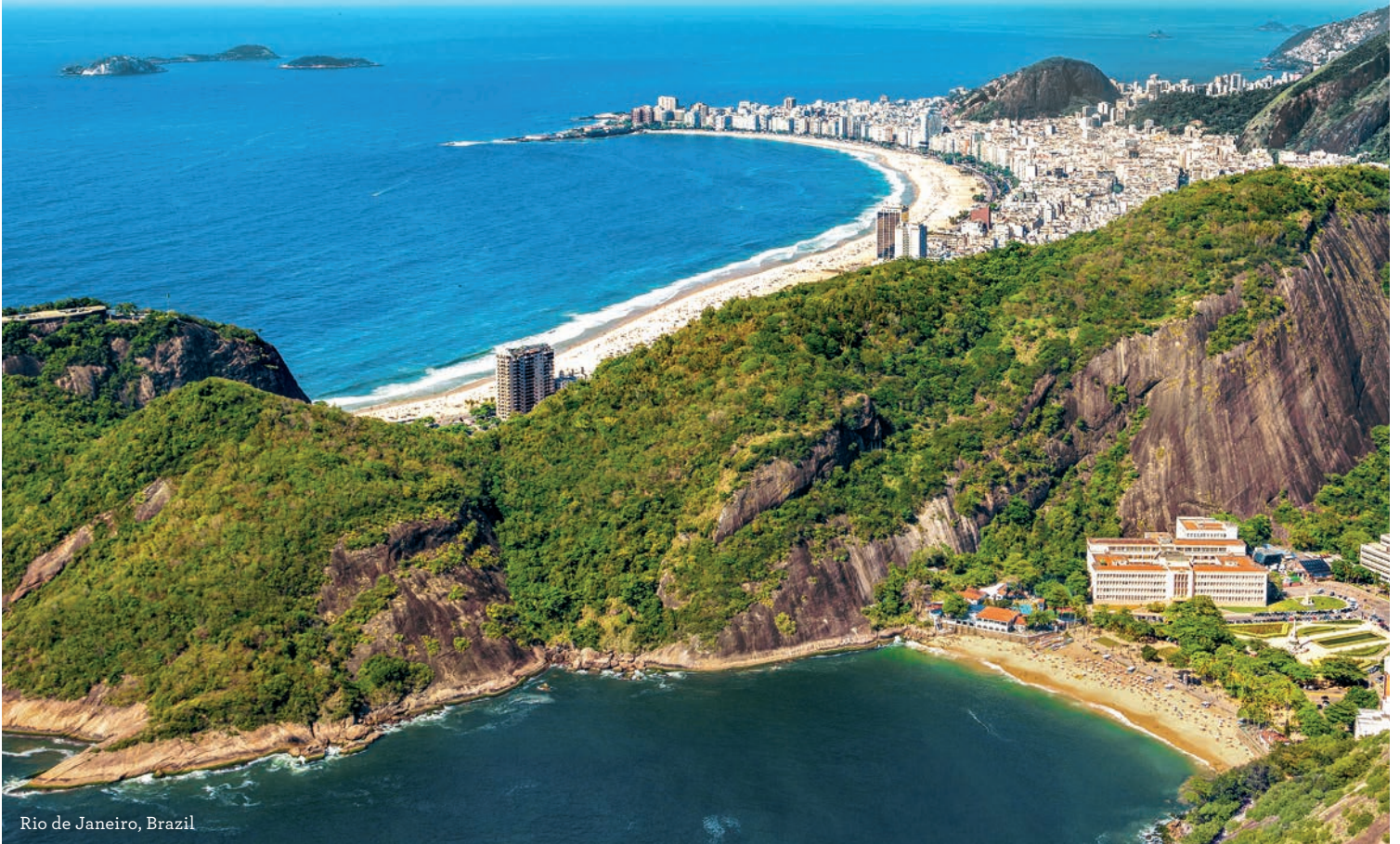
Rio de Janeiro, Brazil

From witnessing mysterious monuments nestled in the heart of the Andes Mountains to encountering vibrant cultures and traversing the legendary end of the world, a journey to South America's shores will ensure that you come back new® in more ways than one.