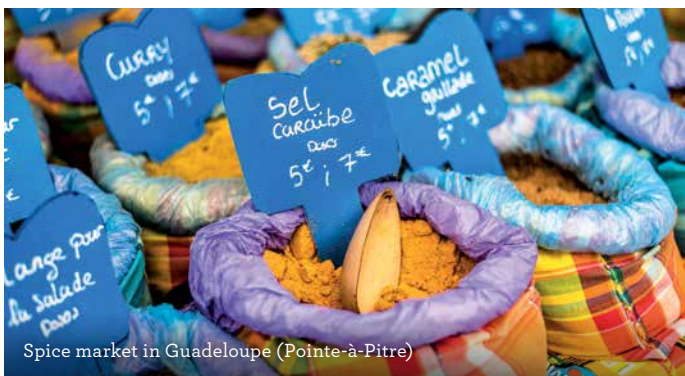
Spice market in Guadeloupe (Pointe-à-Pitre)