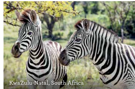
KwaZulu-Natal, South Africa

Visit princess.com/worldcruise for more details.